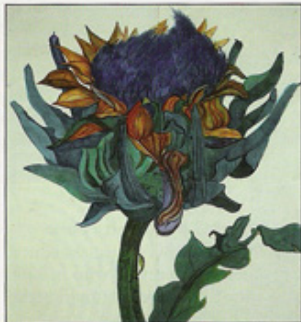
Pievescola Artichoke (156cm x 120cm £4,800)